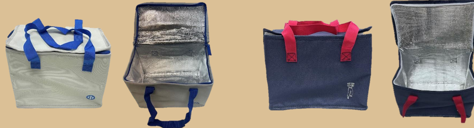
RPET Insulation Bags

Welcome for Wholesale, OEM & ODM, Corporate Gift and CSR Programs